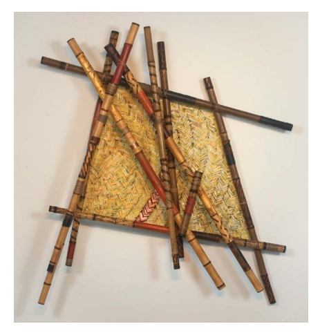
Left Hand Swing , 2010, bamboo with mixed media and painted canvas, 72" x 72" x 8"