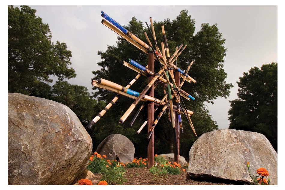
Gateway , Maryland Zoo, Baltimore, 2006, bamboo and mixed media, 12' x 10' x 36". Temporary installation for the American Bamboo Society Conference.