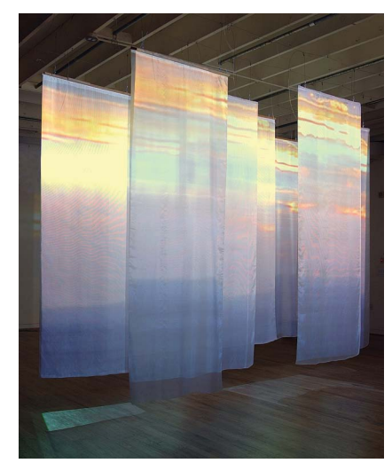
Entering Emptiness, 2005-6, Water/sky images projected on silk. Beach sounds.

Renee loves working with materials that absorb, conduct, refract, and reflect light and create shadows. Her video images come out of traveling all over the world – images of patterns of color, light and movement. They are carefully edited, put on an endless loop and projected on scrim and various three dimensional geometric