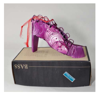
Jane Pettit, Warrior , cat food can lids, nutmeg grater (heel) dryer duct repair scrap, 8 x 13 x 2