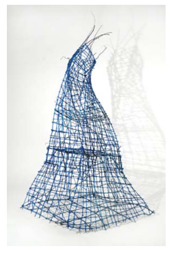
Julia Bloom, Clear Forest Trees for Woods II , painted wood, 78 x 53 x35 (see Solo Shows)

In 2012 WSG will conduct its first automated survey of members to assess members interests, use of membership benefits, exhibition involvement, and to assist us in designing programs and benefits to best serve you. Please keep an eye out for the survey email in January.