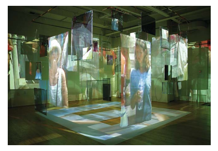
Movement in B Flat , 2006, geometric elements arranged in a maze. 2 projectors. Repetition of B flat.

Danziger, among others. They were able to acquire some of the collection by trading art for antique quilts from her vast quilt and folk art collection. Butler and White occupy two stories of their building, with soaring ceilings, skylights and generous working and living space. They are surrounded by both their collected and created art.