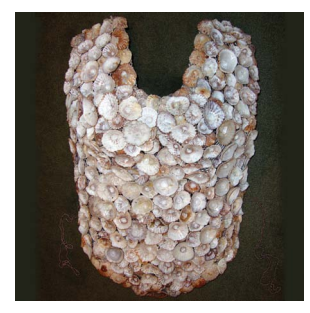
Athena Tacha, Pacific Breastplate