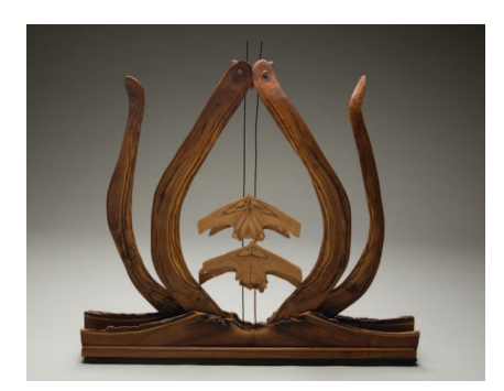
Epiphany, walnut, dogwood, 32 x 32 x 5 in

During her first year in college at Bethel College she enthusiastically experienced the Bauhaus principles: exercises in color studies, juxtapositions of shapes, frugal use of materials. But her early influences dragged at her – maybe too much pleasure was bad for her morally. So she transferred to Oral Roberts University to "save... [herself] from perdition." Fortunately,