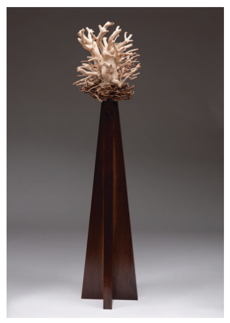
Gnossis, walnut, boxwood, 64 x 14 x 14 in

At Hunter College in NYC, she found she had a real "karma" for finding affordable apartments and lived "all over New York" while earning a BA in fine art. She