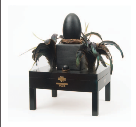
Nest XV, 15x12x12

them "paintings" and did not then consider them as sculpture.