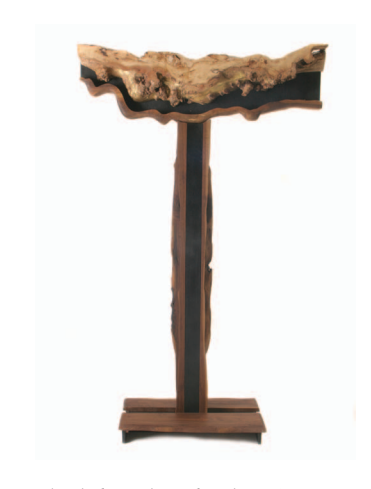
Beacon, burled maple and walnut, 74 x 48 x 16 in

became the Director of the Children's Museum near Ft. Meyers Florida and became involved with a native plant society, studying native trees. But her art had not yet begun to emerge as her main focus. Three years later, she moved to the DC area where for five years she had various contracts with the Smithsonian Institutions, including a visitor