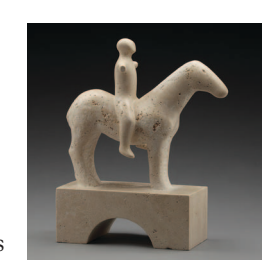
Claire McArdle, Senza Tempo, Italian travertine, 17 \times 20 \times 6 in