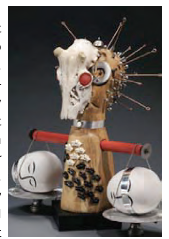
Justice, 21 x 21 x 12 inches

spacious, art filled, welcoming family room which ended only with her last illness.