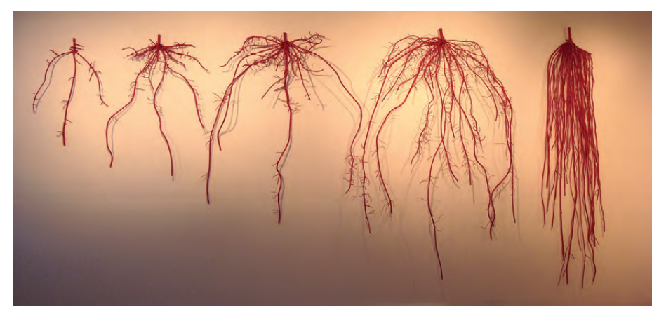
Roots of Winter Wheat: From 10 Days Old to Full Maturity, 2013, painted steel, 108 x 240 x 24 inches

What next? Well, a recognition that roots logically lead to a more exposed, upward existence opens a whole universe of "above ground" considerations. And I had the privilege of seeing her very first such depiction —an alfalfa blossom.