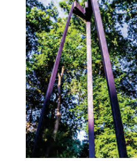
Garret Strang, Nightwatch , wood and graphite, 108 x 30 x 16 inches