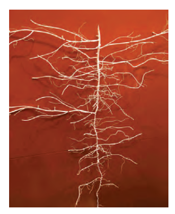
Roots of Liriope, 2012, painted steel, 192 x 216 x 24 inches