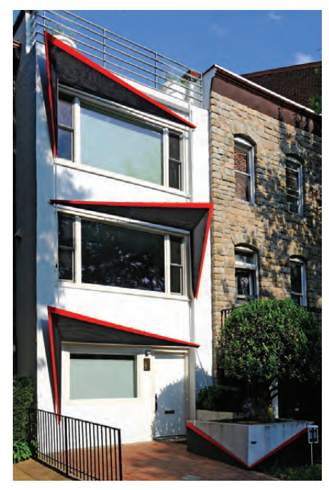
Mascara (Foggy Bottom)

In the mid '80s he married his high school sweetheart, supporting them by doing cabinetry and museum installations. He spent 10 years in a cabinet workhouse—hot in summer, cold in winter, breathing in chemicals and wood dust. In 1999, an introduction to AutoCad software got him "off his knees and onto a chair." He became a draftsman through a headhunter for Design and Productions in Lorton VA. He designed and diagrammed cases and security elements for mounting museum exhibitions. Being an engineering/construction