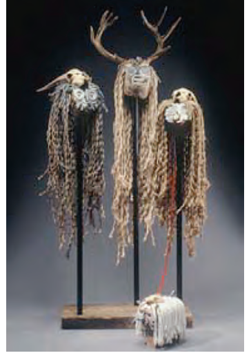
Warmongers and Their Pet Dog, 72 x 37 x 25 inches