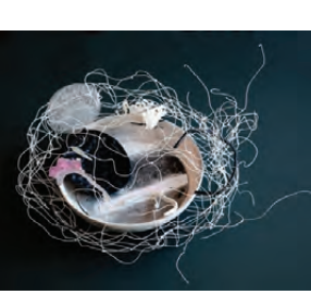
Mila Kagan, A Stone, A Leaf, An Unfound Door, wire, resin, bubble wrap, ceramic, kuzo, wood and plaster, 24 x 30 x 24 inches