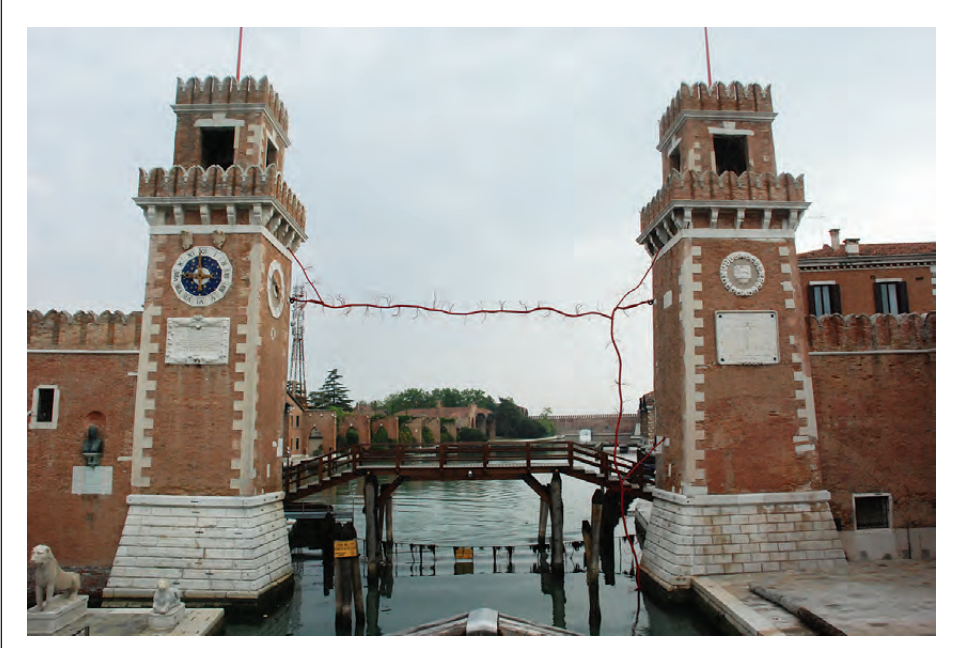
What if Roots Could Grow in the Waters of the Arsenale, 2011, painted steel, 50 x 53 feet

A partial list of the enviable venues where she has recently shown include the American University Museum at the Katzen Arts Center (twice), the Kreeger Museum (twice), the Venice Biennale, Triennale Museum,