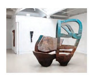
Rachel Rotenberg, Rayne, cedar wood, oil paint, 8 x 4 x 7 feet