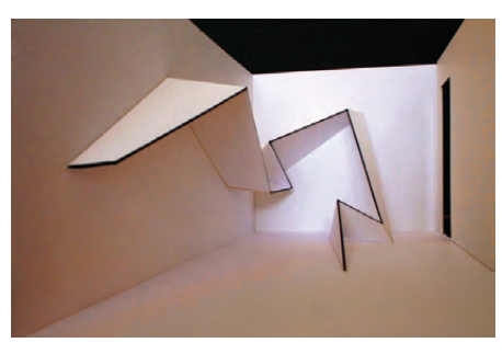
Outer Space, scale model

and family, including home schooling their son. His creative outlet became the camera and the thrust to build an architectural vocabulary. An introduction of computer aided design led to the last 14 years of designing software for Neosys Corporation and the USPS Engineering headquarters.