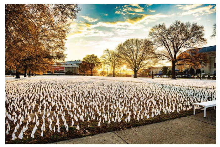
Suzanne Firstenberg, flags memorializing Covid deaths

of magnitude may be the only way to reach the nation's conscious when numbers are this high and the realities are too brutal to acknowledge. In this case, the meaning of the flags, like the quilt and the poppies, was completed by the victims. It is no wonder that this