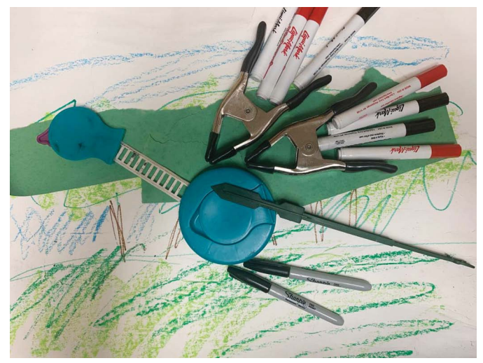
Bird With Background Assemblage: Teacher Demonstration, mixed media, 18 x 24 x 2 inches

Considering that few critically acclaimed, contemporary works are appreciated solely for their good looks, why is it that beauty should still be the central goal of so much instruction for younger people? The truth is that, where I like handsome objects, we have trouble defining, in certain terms, what beauty is and so, in a world in which we must admit that there may be no normative criteria for taste, the best any of us can do is become good at describing what we are doing.