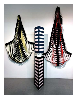
Judith Pratt, Point of Origin: Hides (installation), acrylic paint, acrylic ink on Lenox 100 paper, foamcore board, 8 x 15 x 3 feet (dimensions variable)