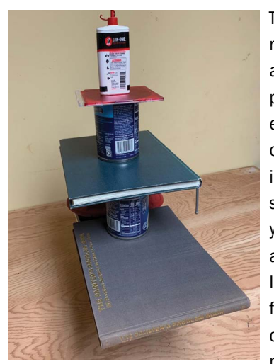
Tower Assemblage: Teacher Demonstration, mixed media, 24 x 14 x 10 inches

I believe that artists must make the most of ourselves by challenging the field with as many provocative works as we can muster. These refreshing confrontations cannot come from repeating conservative patterns of aesthetic object making, no matter how skillful or beautiful the results, so art lessons that singularly conform to commonly understood standards of beauty probably don't challenge the status quo and, thereby, don't reveal much about our current context. They simply reiterate and reestablish old ones. This is in direct conflict with what the art world seems to value at this point in time. In other words, making work that does not express fresh and interesting points of view probably won't help children, or adults, critically think, which seems to be the point of art as it is practiced today.