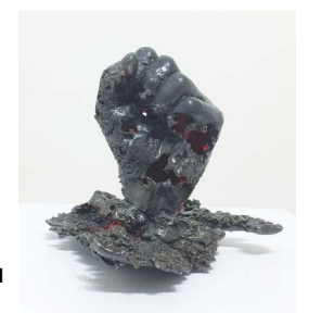
Esperanza Alzona, Rise Up,