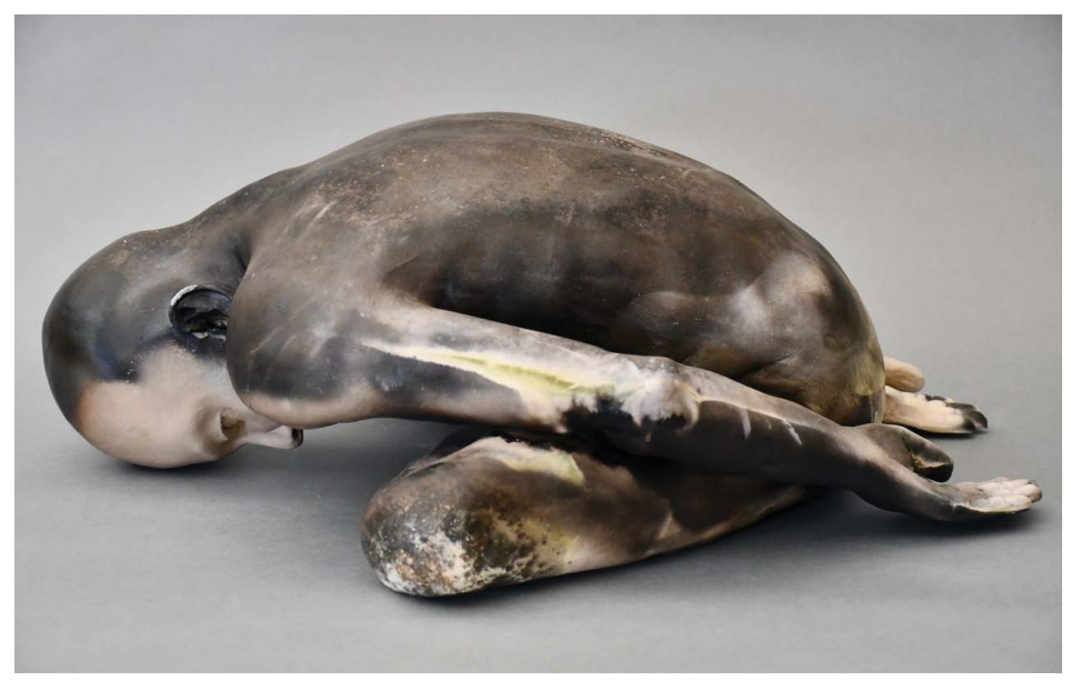
Chris Corson, Plinth, pit-fired ceramic, 8 x 18 x 23 inches

Events that are likely to be available after publication will be marked with a . .