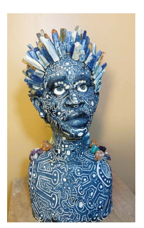
Chris Malone, Anika, ceramic, tile, stones, and crystals, 18 x 9 x 8 inches