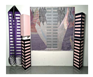
Judith Pratt, Point of Origin: Station #1 (installation), acrylic paint, acrylic ink on Lenox 100 paper, foamcore board, 8 x 15 x 5 feet (dimensions variable)