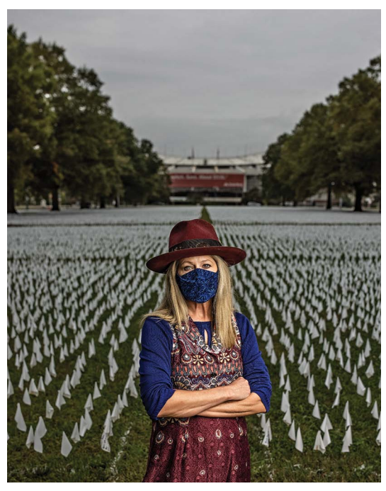
The artist in front of flags

extra weeks on display, until November 30. I can only imagine that this piece's extension was guaranteed by being the right message (one of empathy), in the right place (the city where